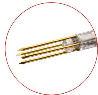
Protective Plate Retracted