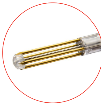
Protective Plate in Place